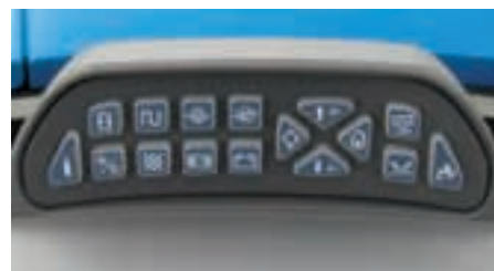
An enhanced performance monitor and radar are optional on all Plus and Elite models, allowing you to track and program a variety of functions including linkage height, PTO speed, hours, distance traveled and electronic remote valve status.