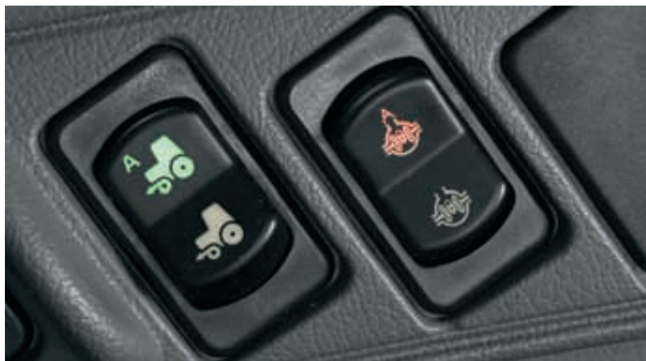
The TerraLock™ system automatically controls FWD and differential lock engagement to give you maximum traction and control.

Self-adjusting, self-equalizing hydraulic wet disc brakes deliver the stopping power you need. When both brake pedals are applied simultaneously, FWD engages automatically to aid in braking action for added control.