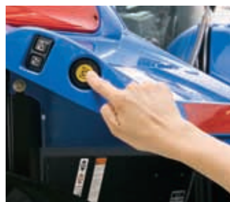
Quick-raise hitch switches are provided on both rear fenders on tractors equipped with electronic draft control. An exterior PTO switch is also optional on the rear fender of all cab models (except 12x12 transmission). Press the button for less than five seconds for a pulsing action that makes it easier to hook up the PTO shaft. Hold the button for longer than five seconds to fully engage the PTO.