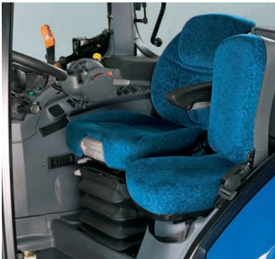
A comfortable, supportive, full-size instructor seat is a Horizon cab option.

For the absolute smoothest ride over bumpy ground, choose the Comfort Ride™ Cab Suspension option available on Plus and Elite models. This simple mechanical system is always on. Two isolation "donuts" at the front corners of the cab and a swaybar and two shock absorbers at the rear isolate you from up-down motions and side-to-side swaying.