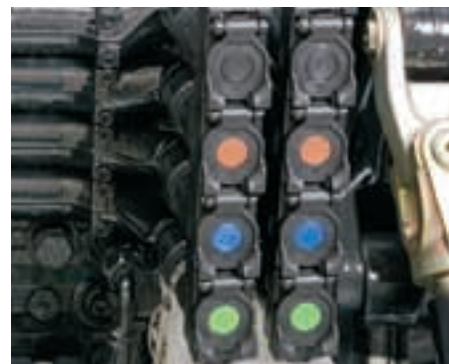
Hydraulic control levers and remote coupler dust covers are color-coded to assist with easy implement hook up and control.